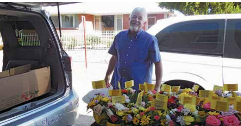
REACH OUT AND TOUCH The team at Allan's Flowers & More has increased its philanthropic efforts with events such as SAF's Petal It Forward and Teleflora's Make Someone Smile campaigns.