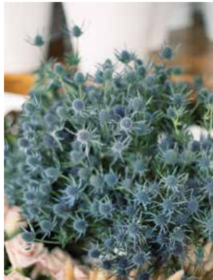
BLUE ERYNGIUM Mayesh Wholesale