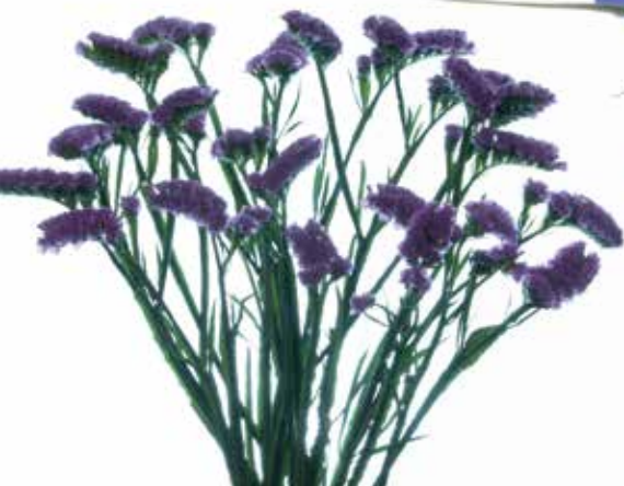
'DINO VIOLET' LIMONIUM Dümmen Orange