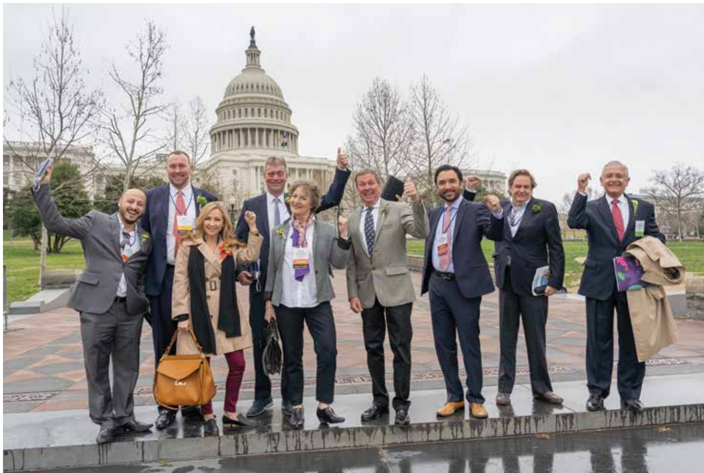
TAKING ACTION The Society of American Florists' 2020 Congressional Action Days provided attendees an opportunity to talk with legislators about the biggest issues facing the industry. The event is back in person this year.

Register now for CAD 2022. Visit safnow.org/congressional-action-days to learn more. 🌿