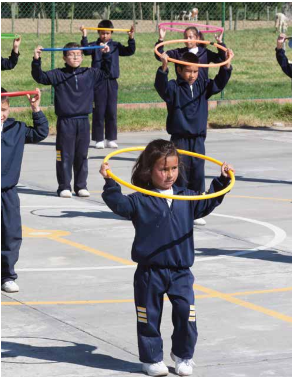
WORK AND PLAY Many certifying organizations have standards in place that extend benefits to the people who live near certified farms. For example, Florverde Sustainable Flowers' agenda embraces programs that directly benefit children near the farms it certifies. Here, children participate in after-school activities as the result of a joint effort between Florverde and a local municipality.