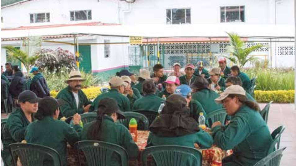
LUNCH BREAK A subsidized hot lunch (costing workers the equivalent of about 10 cents in U.S. dollars) is one of many benefits designed to attract and retain a skilled, loyal workforce at Colombian rose grower Alexandra Farms, certified by Florverde Sustainable Flowers (FSF).

Even if it's not always top of mind, sustainable sourcing could have even greater value when flowers are a social expression, versus a casual everyday purchase, says Jacob Davignon, who leads a global team for key markets and retail at Rainforest Alliance, one of the best-known certifiers of sustainable farm products. For instance, compare flowers with diamonds. In