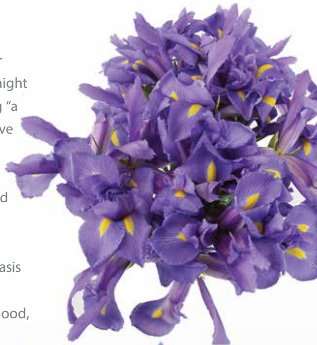
'SHANGHAI' IRIS Sun Valley Floral Farms