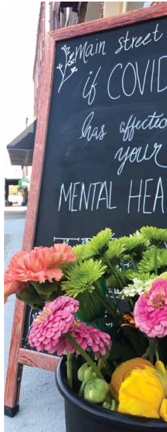
GIVING BACK Spreading joy to the community with flower giveaways has been a good team-building practice for the staff at Main Street Florist in Carlinville, Illinois.

The principal driver is prioritizing mental health. "We want people to know that they're not alone, that everyone is struggling on some level," LoBue says. "If anyone can relate to struggles, it's florists. We're a lot like therapists, listening to what people are going through. Our arrangements are like shared emotions." 🌸