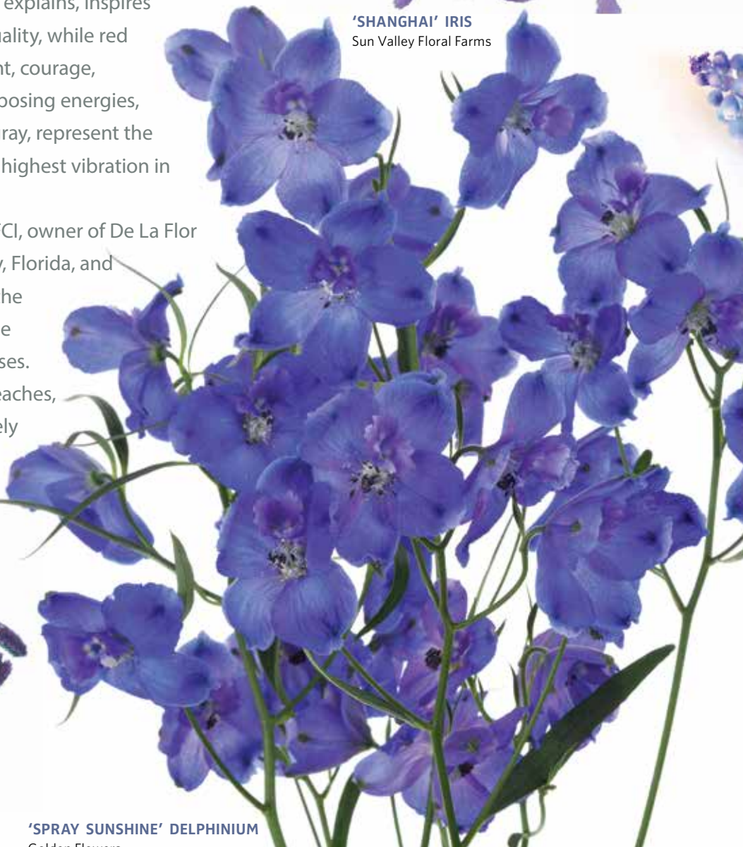
'SPRAY SUNSHINE' DELPHINIUM Golden Flowers