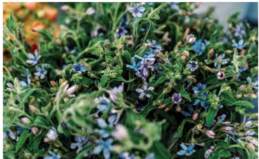
BLUE TWEEDIA Mayesh Wholesale