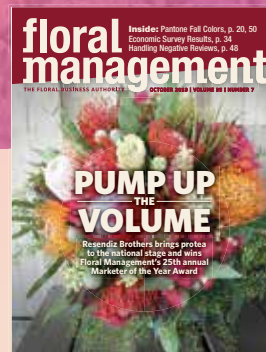
2018 Winner: Resendiz Brothers Protea Growers, Fallbrook, California