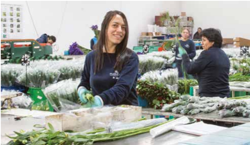
SUPPORTING WOMEN The workforce on Colombian flower farms includes many women. The culture of sustainability — along with a competitive labor market — has led to benefits for female workers, including daycare for children.