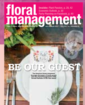
2017 Winner: The American Grown movement, Santa Barbara, California