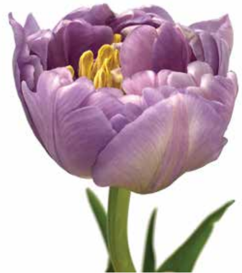
'PYTHON' DOUBLE TULIP Sun Valley Floral Farms