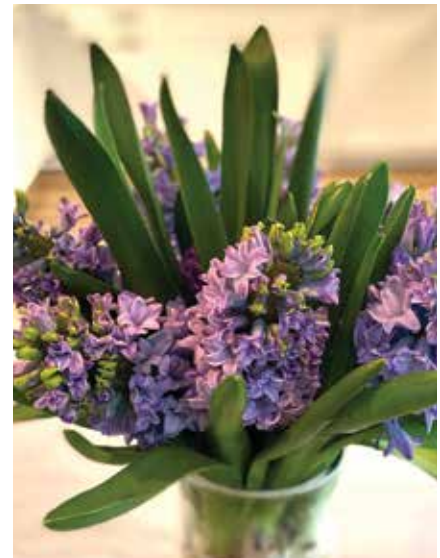
'BLUE EYES' HYACINTH Oregon Flowers