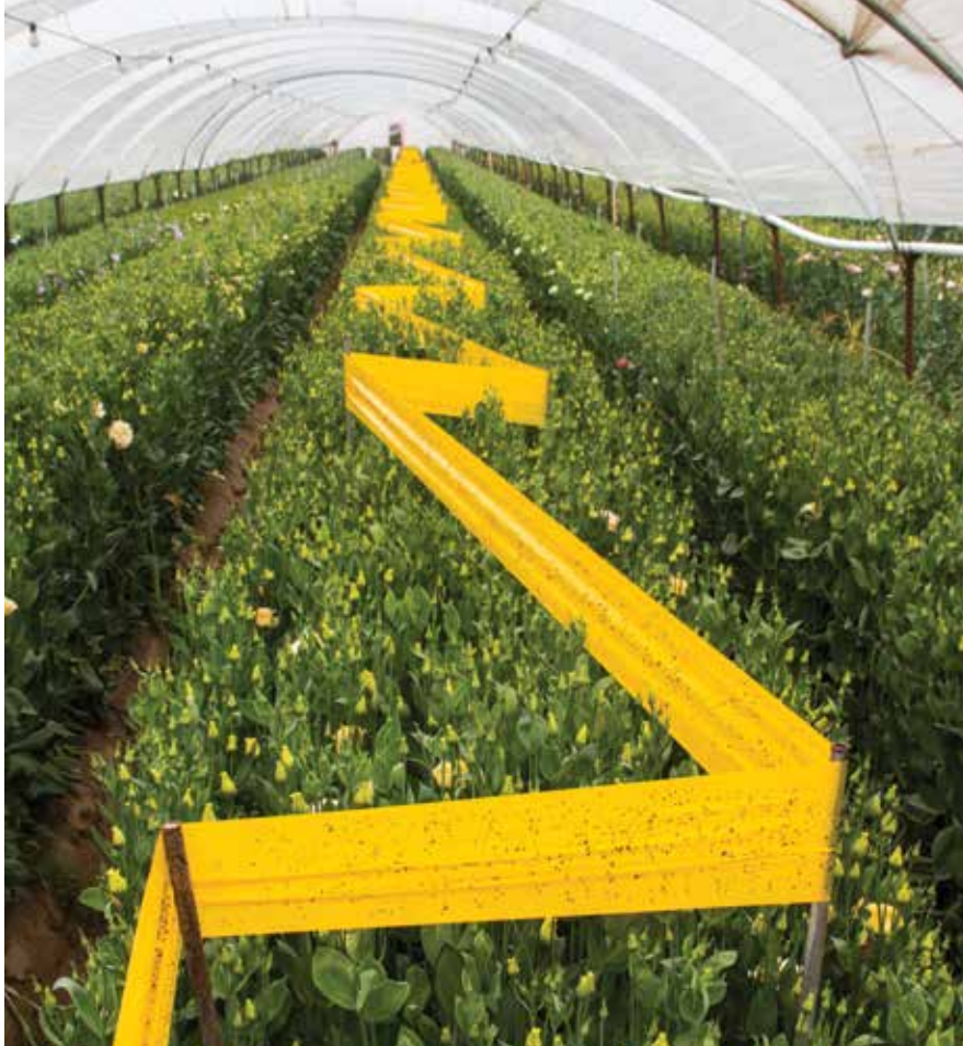
STUCK UP A method as simple as using sticky tape, seen here winding through a hoop house of lisianthus at Sun Valley Floral Farms’ Oxnard, California, location, offers an environmentally friendly alternative to pesticides. Adding garlic to the water also helps keep bugs off the plants.