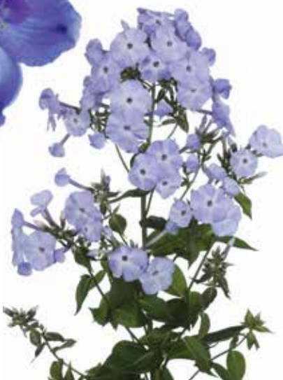
'MISS LOLITA' PHLOX Dümmen Orange