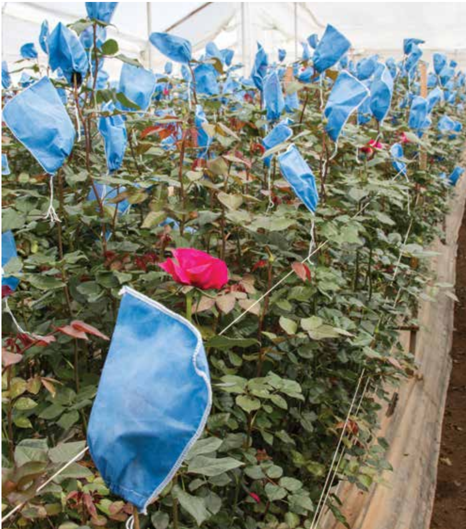
HELLO, GOODBYE At Alexandra Farms, mesh mitts are applied by hand to rose buds. The fine mesh protects the flowers from many types of pests, even spores of botrytis mold, reducing the need for chemical pesticides or fungicides.

the market for diamonds, “conflict free” has become one of the standard criteria for purchases — driven by demand from Millennials and enabled by blockchain technology that enables traceability from mine to store.