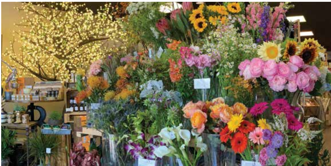
DOUBLE DUTY The stem bar at WildFlower Stem + Sundry serves as an impressive display and a way for customers to interact with flowers.

“The idea was to make the stem bar a fully interactive flower experience,” says WildFlower owner Christine Guenther about the highly successful concept. “It’s not a temporary feature; it’s the cornerstone of our shop.” Every day at her flagship Glen Burnie location, a large cart filled with dozens of flower varieties invites customers to experience the scents and textures normally reserved for a designer’s table.