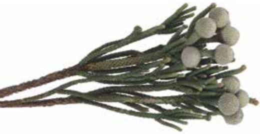
'SILVER' BRUNIA BERRIES DVFlora