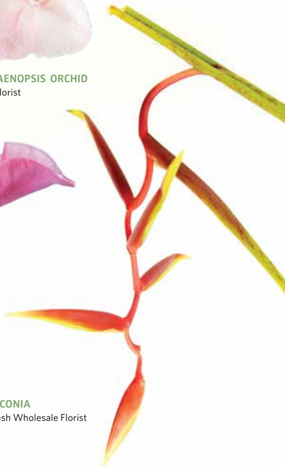
HELICONIA Mayesh Wholesale Florist