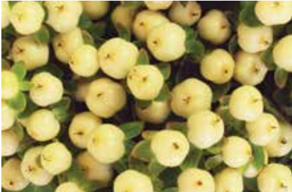
'VANILLA' HYPERICUM BERRIES Fifty Flowers