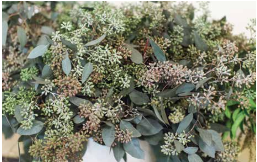
SEEDED EUCALYPTUS Mayesh Wholesale Florist