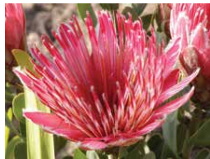
'IVY' PROTEA Resendiz Brothers Protea Growers