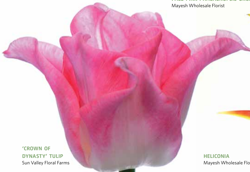
'CROWN OF DYNASTY' TULIP Sun Valley Floral Farms