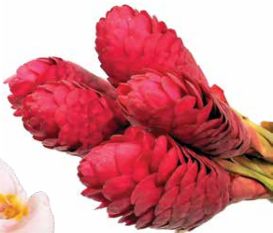
'JUNGLE KING' GINGER Mayesh Wholesale Florist