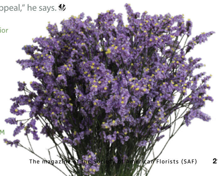
PURPLE LIMONIUM Royal Flowers